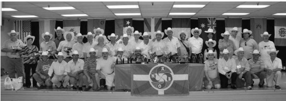
XXXIII World Mus Tournament

We will have to distinguish the Basque brand or else lose out in the marketplace of cultural identities.